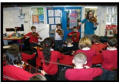
Year 4 Violins and Violas

Real experiences help to deepen children's understanding of things. We try to organise lots of enriching activities such as trips, visitors in school, theatre companies, musical events and storytellers' etc. to support our curriculum. There is sometimes a charge associated with such activities, where parents/carers are asked to make a voluntary contribution. However, if sufficient voluntary contributions are not received, trips or visits may be cancelled. No child will be excluded from an activity, visit or trip during school hours because a voluntary contribution has not been received. We often take the children on local visits to support their learning to places such as the library, church etc. You will be informed that we are taking your child out of school. For trips further afield, clubs etc. children can only participate if the relevant paperwork has been completed by parents/carers.