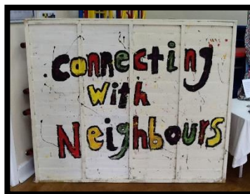
Bilborough Arts Festival